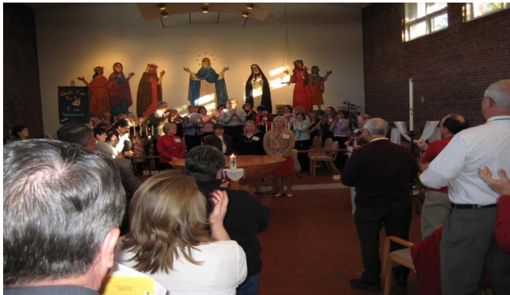
Closing ceremonies Women's Weekend #51 Dominican Spiritual Life Center—October 2007