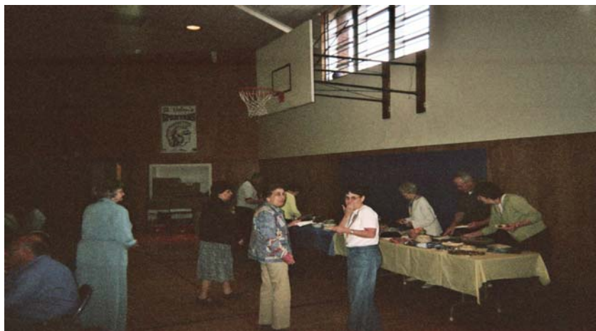
Diocesan Ultreya St/ Helen's April 27, 2008 We gathered, we ate, we shared!

We are called to gather by our baptism to celebrate our faith together.