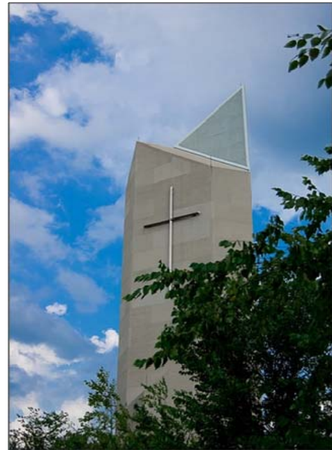
Bell Tower at Rockhurst University

There will be transportation to Rockhurst University on Thursday, July 29 th , from Kansas City International Airport (MCI) only, and back on Sunday, August 1, 2010.